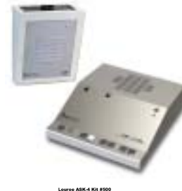
Louroe ASK4 KH 800

Louroe Electronics manufactures audio monitoring systems; several of which are especially designed for sleep applications. The system delivers crisp, clear audio, allowing the technician to closely monitor the patient. The technician can listen to the patient hands-free and needs only to press a switch to talk to the patient. The audio system consists of a speaker/microphone for wall mounting in the patient's room and a desktop receiver for the control room. The receiver has volume control and output to a VCR/DVR for recording along with an input for audio playback. For more information call 818-994-6498. Circle Action Card # 62