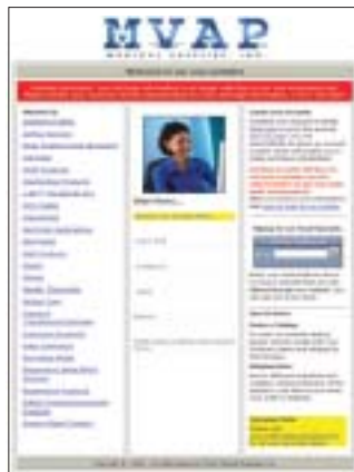
New E-commerce Website

3555 Old Conejo Road Newbury Park, CA 91320 1-877-735-6827 Fax: 1-877-735-7213