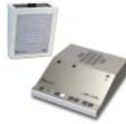
Louroe ASK-4 Kit #500

Louroe Electronics manufactures audio monitoring systems; several of which are especially designed for sleep applications. The system delivers crisp, clear audio, allowing the technician to closely monitor the patient. The technician can listen to the patient hands-free and needs only to press a switch to talk to the patient. The audio system consists of a speaker/microphone for wall mounting in the patient's room and a desktop receiver for the control room. The receiver has volume control and output to a VCR/DVR for recording along with an input for audio playback. For more information call 818-994-6498. Circle Action Card # 59